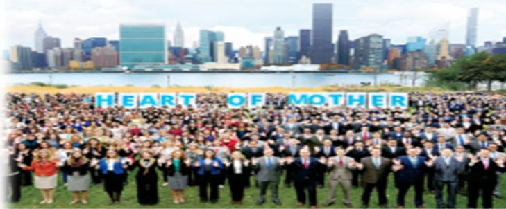
Where the world mission began North America