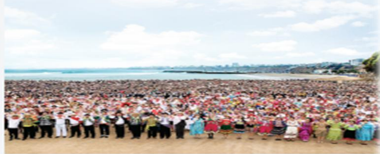
Plant fervor for the gospel and harmony South America