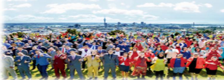
Heavenly Mother's gift to the South Pacific Ocean Oceania