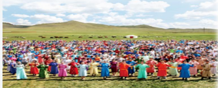
The love of God reaches the Himalayas Asia