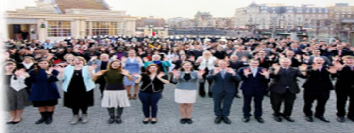
The gospel of the new covenant changes Europe Europe