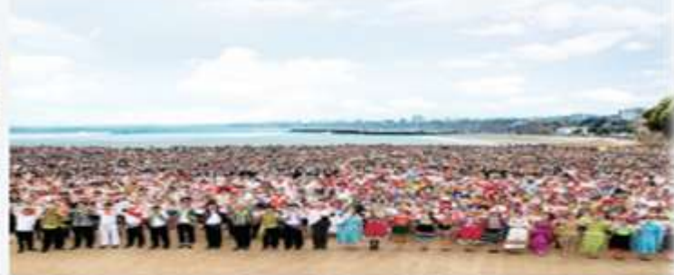
Plant fervor for the gospel and harmony South America