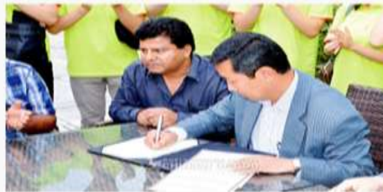
Mayor of Kathmandu

“You’re trying to help Nepalese children with passion and efforts. I’m truly grateful. Today, on behalf of the Nepalese Government and the Ministry of Education, I sign an MOU to build schools. The Government of Nepal gives thanks to you sincerely.”