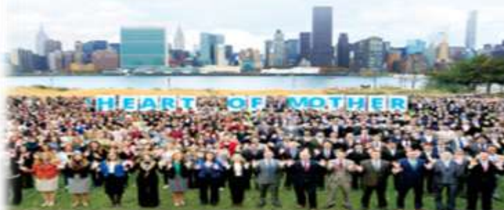
Where the world mission began North America