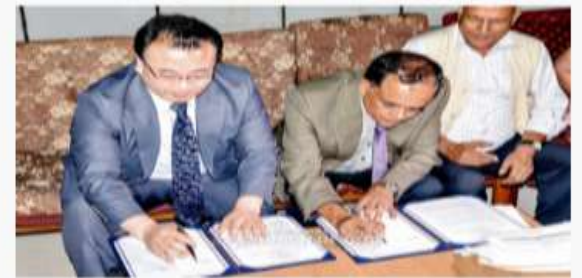
Professor at Tribhuvan University Department of Environmental Sciences

“You’ve made a good proposal to become one under the slogan, ‘Green Kathmandu.’ You will inspire students in Kathmandu, who are the future of Nepal, to work on volunteer services for the better future.”