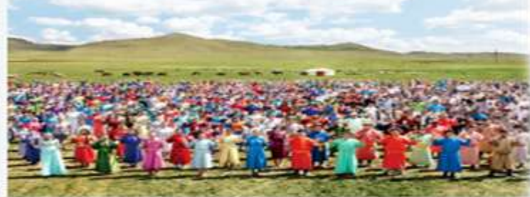
The love of God reaches the Himalayas Asia