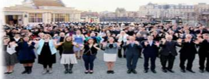
The gospel of the new covenant changes Europe Europe