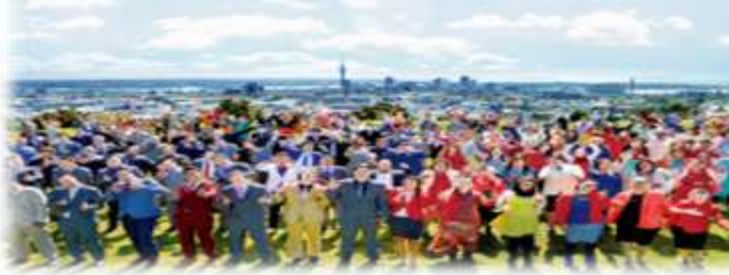
Heavenly Mother's gift to the South Pacific Ocean Oceania