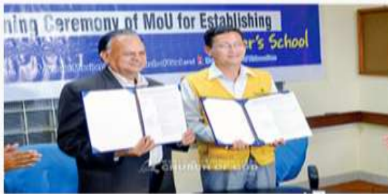
Director General of Department of Education in Bhaktapur